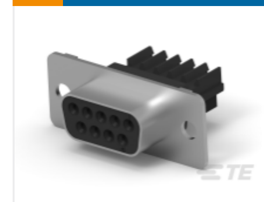
TE Part # CAT-AM7-248H8 IDC D-Sub: Receptacle Assembly, Wire to Wire, Signal, 2.74 mm