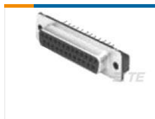
TE Part # 8-338313-2 9POS.HD-20 REC.ASSY