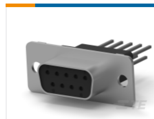
TE Part # 5745183-3 09 RCPT SP/MS STD