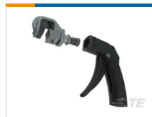
TE Part # 608868-1 HDE HT PKG FOR SUB D