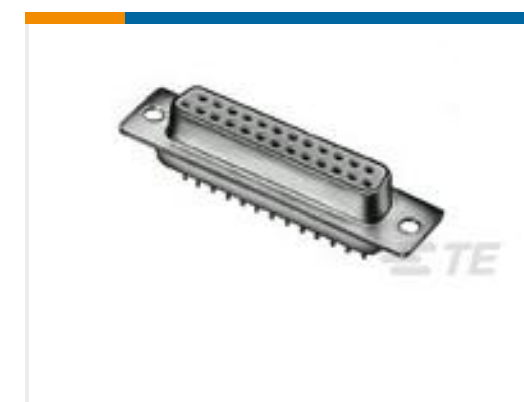
TE Part # 2-1393740-8 V42254A2214B209=SUB D FEDERLEI