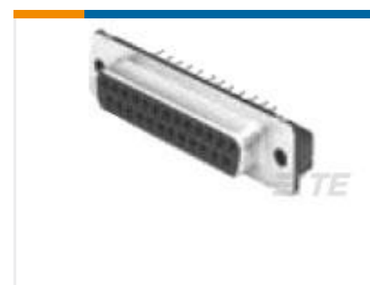
TE Part # 9-338313-2 9POS.HD-20 REC.ASSY