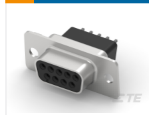
TE Part # CAT-025-DRAVS1274 D-Sub Receptacle Assembly: Vertical, Shell Size 1, 2.74mm