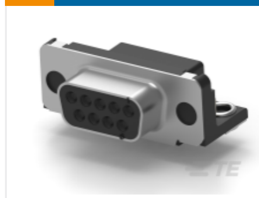
TE Part # CAT-023-DRARS1274 D-Sub Receptacle Assembly: Right Angle, Shell Size 1, 2.74mm