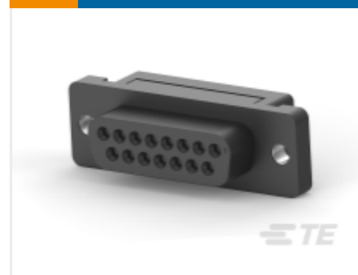
TE Part # CAT-AM7-253 IDC D-Sub: Receptacle Assembly, Low Profile, Signal, 2.77 mm