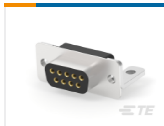
TE Part # CAT-979-DRARE274 D-Sub Receptacle Assembly: Eurostyle, Right Angle, 2.74mm