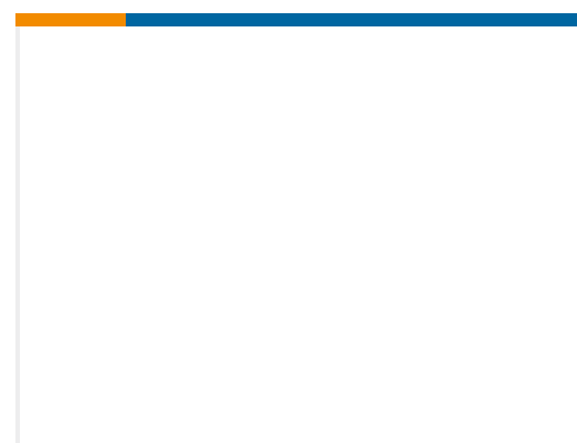
TE Part # 966329-1 HDE 20 KIT 9P