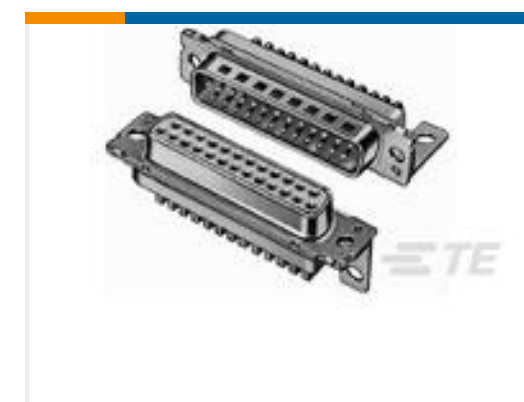
TE Part # 2-1393480-8 V23529B1122B209=SUB D FEDERLEI