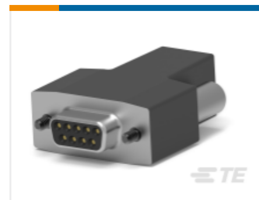
TE Part # CAT-AM7-248H6 IDC D-Sub: Receptacle Kit, Wire to Wire, Signal, 2.74 mm