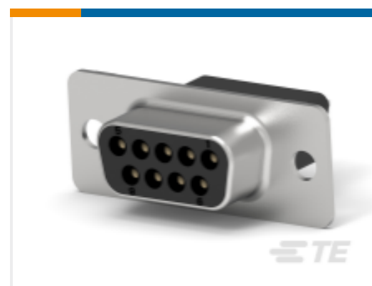
TE Part # 5745183-1 09 RCPT SP/MS STD