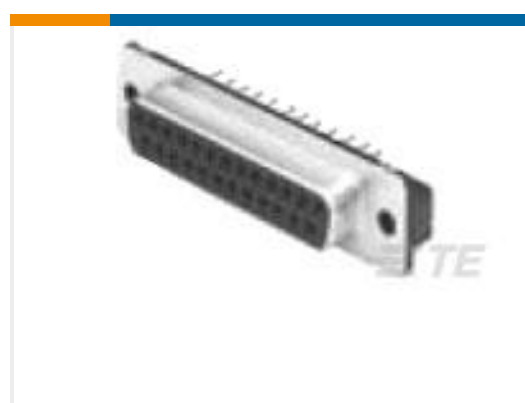
TE Part # 7-338313-2 9POS.HD-20 REC.ASSY