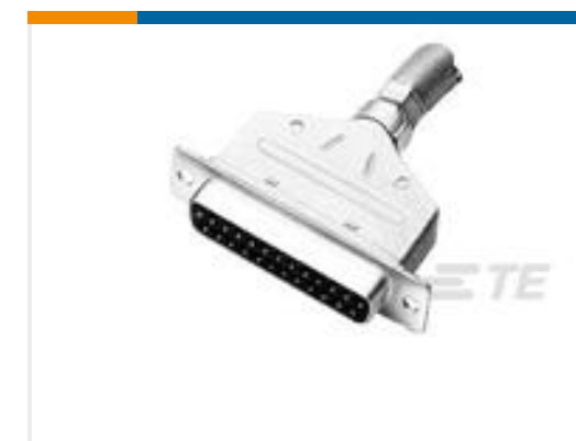
TE Part # 747516-7 09 HDE PMOLD RCPT, LEAD FREE