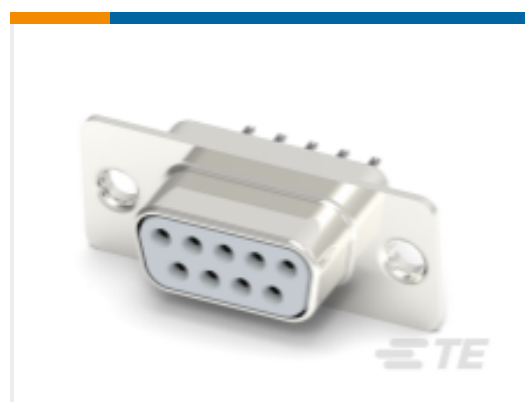
TE Part # 8-1393483-7 V42254A2115B209=SUB D FEDERLEI