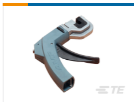
TE Part # 58074-1 MTA 50/100/156 MANUAL TOOL FRAME