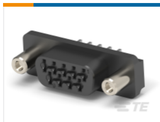
TE Part # CAT-026-RAVSAP1274 D-Sub Receptacle Assembly: Vertical, Action Pin, Shell Size 1, 2.74mm